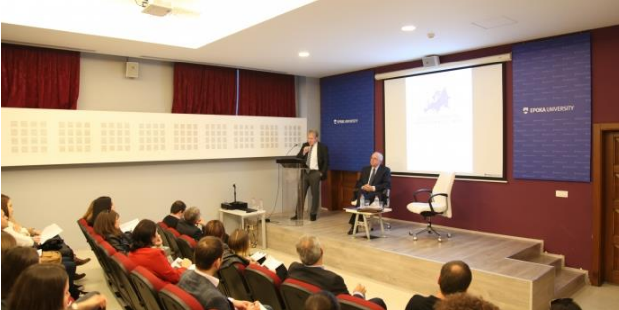
Peace Forum: Debating Europe 100 Years after World War I

The Faculty of Law and Social Sciences has organized today the University Peace Forum titled “ Debating Europe 100 Years after World War I ”. One century ago, the world was transformed by one of the most notorious events to take place in the history of mankind: World War I. Europe was a battlefield where the military, the political and social all clashed with each other, altering the dynamics in the international arena and leaving behind an ongoing legacy. Today we commemorate the centenary of this Great War and its legacy which will continue to shape the future of Europe and world politics.