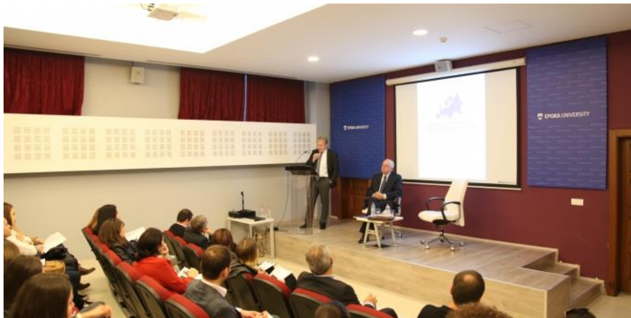
Peace Forum: Debating Europe 100 Years after World War I

The Faculty of Law and Social Sciences has organized today the University Peace Forum titled “ Debating Europe 100 Years after World War I ”. One century ago, the world was transformed by one of the most notorious events to take place in the history of mankind: World War I. Europe was a battlefield where the military, the political and social all clashed with each other, altering the dynamics in the international arena and leaving behind an ongoing legacy. Today we commemorate the centenary of this Great War and its legacy which will continue to shape the future of Europe and world politics.