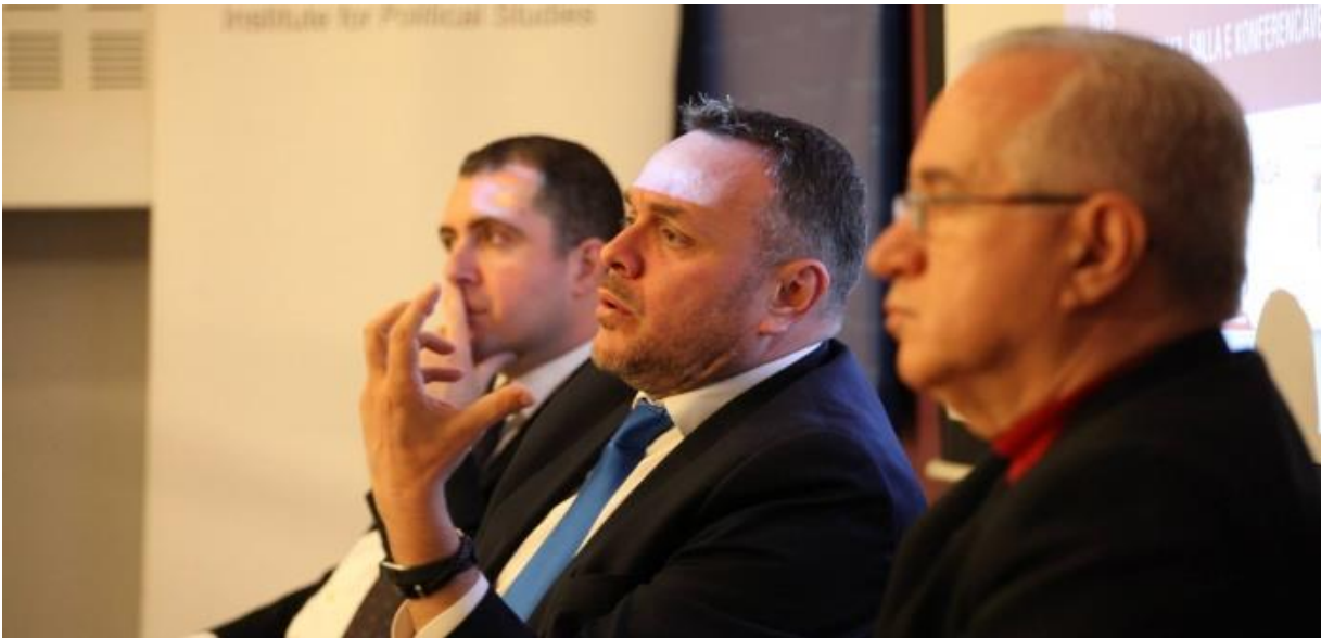
The panel on "Justice Reform: Progress and Challenges" was held at EPOKA University

The Panel on " Justice Reform: Progress and Challenges " was held on March 13, 2019, under the auspices of the Department of Law and the Faculty of Law and Social Sciences, in cooperation with the Institute of Political Studies (ISP), in the framework of the project titled "Justice Reform: With Citizens and For Citizens ", funded by the Open Society Foundation for Albania.