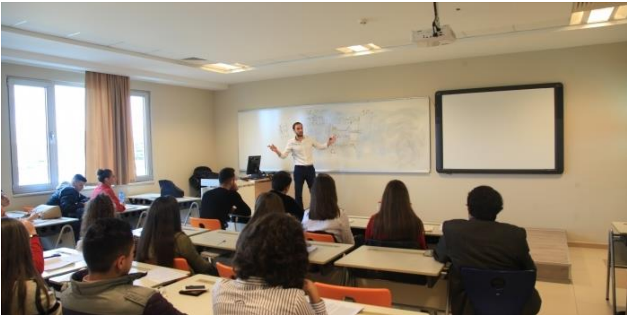
Open Lecture: Representation and Civil Society in Albania