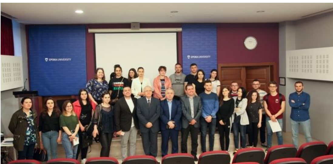
The panel on "Administrative-Territorial Reform: Progress and Challenges" was held at EPOKA University