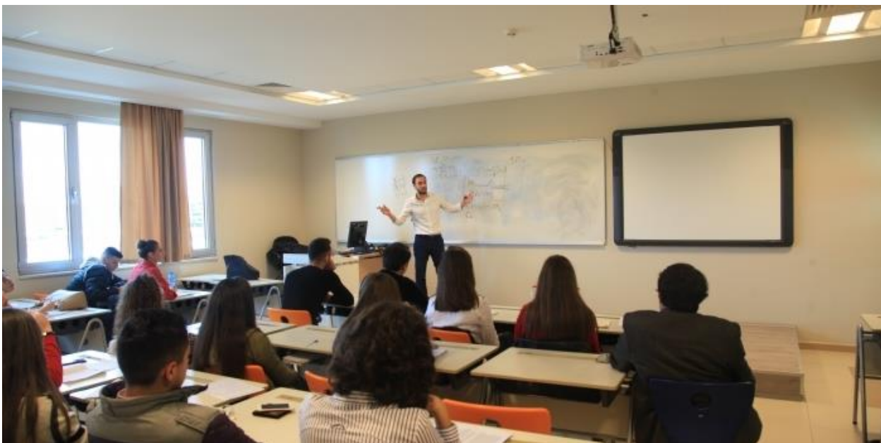
Open Lecture: Representation and Civil Society in Albania