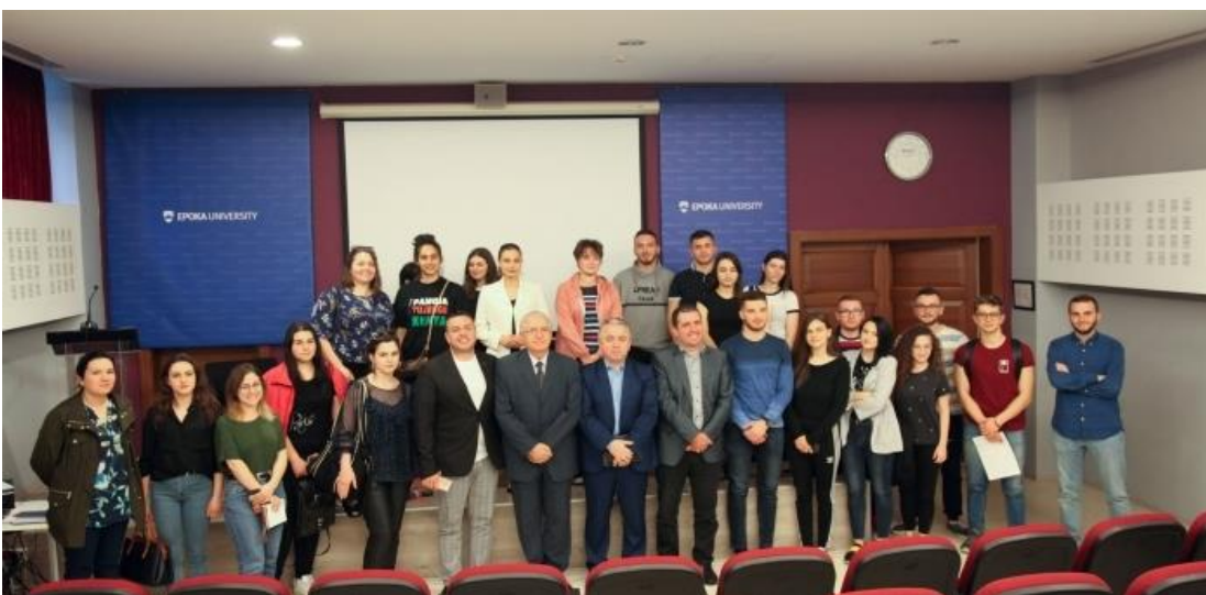
The panel on "Administrative-Territorial Reform: Progress and Challenges" was held at EPOKA University