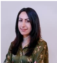
MSc. Ada Cara CORE ENGLISH DEVELOPING READING AND WRITING SKILLS