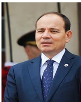
MSc. Bujar Nishani EUROPEAN FOREIGN AND SECURITY POLICY